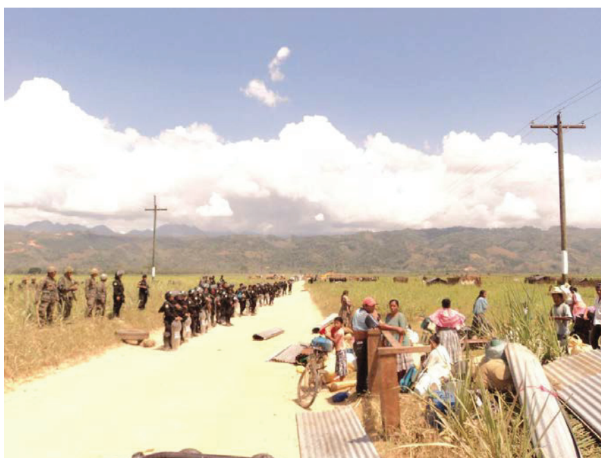
Miralvalle, Polochic Valley, Guatemala, 15 March 2011. The community was evicted, their houses and crops destroyed.

The new wave of land deals is not the new investment in agriculture that millions had been waiting for. The poorest people are being hardest hit as competition for land intensifies. Oxfam's research has revealed that residents regularly lose out to local elites and domestic or foreign investors because they lack the power to claim their rights effectively and to defend and advance their interests. Companies and governments must take urgent steps to improve land rights outcomes for people living in poverty. Power relations between investors and local communities must also change if investment is to contribute to rather than undermine the food security and livelihoods of local communities.