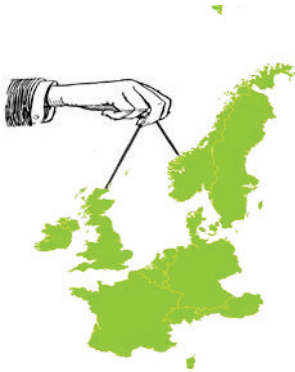
Figure 1: Global land deals

227 million hectares are reported to have been acquired since 2001, an area of land the size of North-Western Europe.